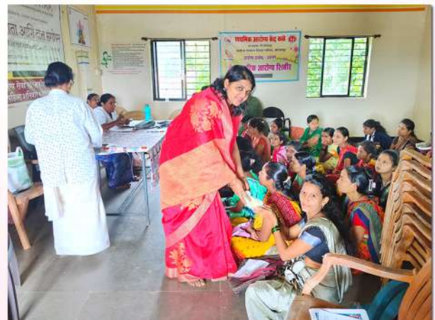
Divine Mother and Child Health Program